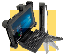
Vehicle Mount plus rugged keyboard